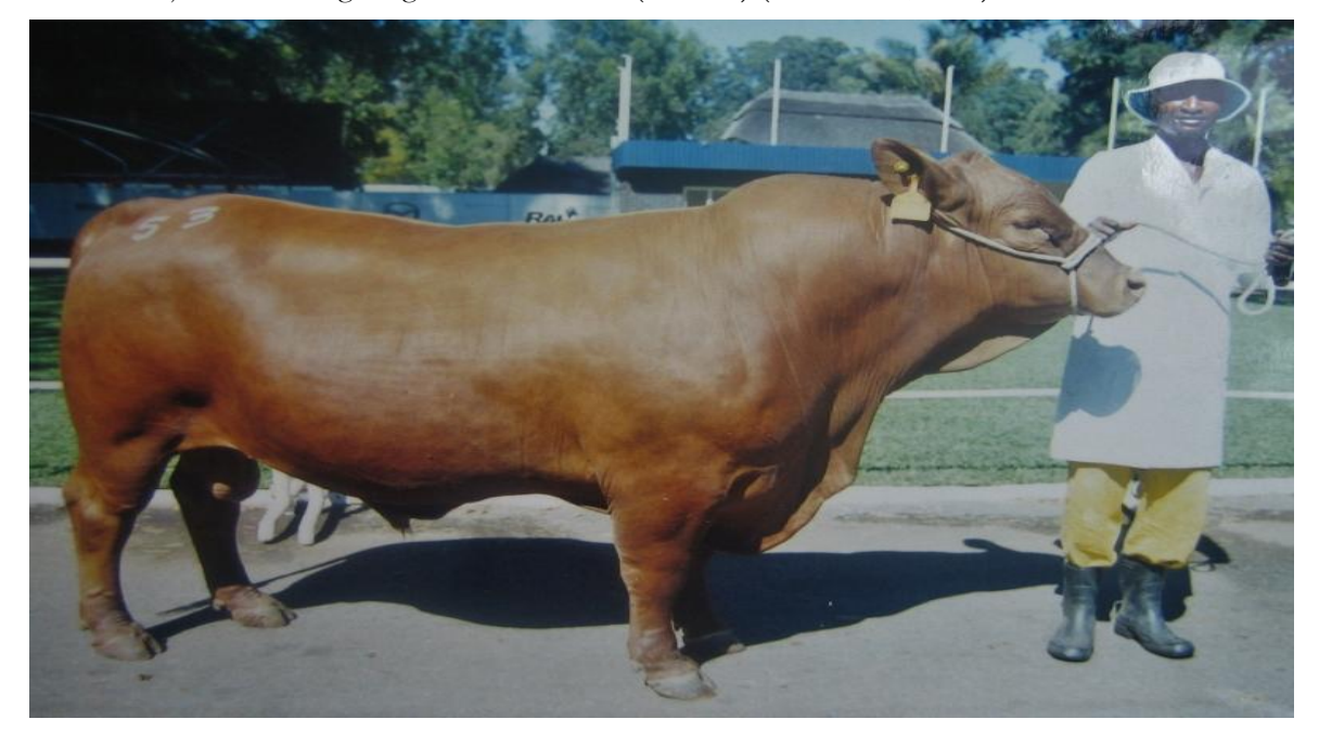
Figure 4. Senepol bull at Annual Bull Sale in Harare, Zimbabwe (Photograph: Trevor Wilson, July 2000).

In a somewhat bizarre turn of events the Senepol breed has found its way from the Caribbean back to its African roots. Senepol are now found in Zimbabwe (Figure 4) and South Africa where there is a breed society. Senepol have also arrived in Australia where there is also a breed society. In one experiment carried out on St Croix, Senepol x Senepol calves had heavier (P < 0.01) birth weights and heavier (P < 0.01) 205-d adjusted weaning weights than Hereford x Herford calves. Birth weights of S x H calves were heavier (P < 0.01) than the mean of the purebred calves but 205-d adjusted weaning weights did not differ (P > 0.10) (Chase et al., 1998).