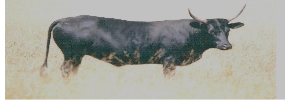
Figure 9. Shona (Sanga) cow on communal grazing in Masvingo District in Southern Zimbabwe (Photograph: Trevor Wilson, February 2000).

Crossbreeding for beef has been less than that for milk production. In one study in Zimbabwe, however, beef production was the aim. Cow genotypes comprised Mashona (Figure 9), Nkone, Tuli, Afrikaner, Brahman, Sussex, Charolais and various crosses amongst them. These were mated annually from 1979 to seven terminal sire breeds which were Afrikaner, Tuli, Brahman, Aberdeen Angus, Hereford, Simmental and Holstein-Friesian.