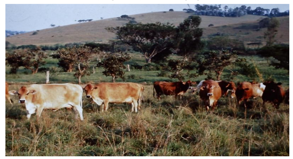
Figure 1. Jersey-Sahiwal crosses at the Songa research station of the Institut des Sciences Agricoles du Rwanda

have often been paramount. There have, of course, been several introductions of "international" breeds such as the Jersey and the Holstein-Friesian (the latter in many situations definitely not being "fit for purpose"). Jerseys, for example, have been used in situations as diverse as Cameroon (Mbah et al., 1986), Egypt (Khishin and El-Issawi, 1954), Ghana (Sada and Vohradsky,1968), Rwanda where they were crossed with Sahiwal rather than with local cattle (Figure 1) (Compère, 1963) and Uganda (Kiwuwa and Redfern, 1969). Holsteins and Friesians similarly have been introduced to many countries including Cameroon (Mbah et al., 1986), Ethiopia (Alberro, 1983; Haile et al., 2009), Nigeria (Knudsen and Sohael, 1970; Johnson and Oni, 1986), Uganda (Trail et al., 1971) and Zambia (Mubita, 1992). Brown Swiss have been used in Rwanda (Compère, 1963) and Mozambique (personal observation).