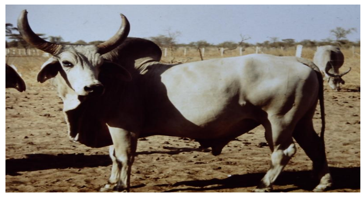
Figure 3. Kankrej (Gujerat) bull imported to Senegal from Brazil at the Dahra Research Station of the Institut Sénegalais de Recherche Agricole (Photograph: Trevor Wilson, February 1986).

In the second decade of the twentieth century N'dama cows were put to Red Poll bulls (why were they in St Croix?) with the result that a new breed – the Senepol – was formed (Hupp, 1981).