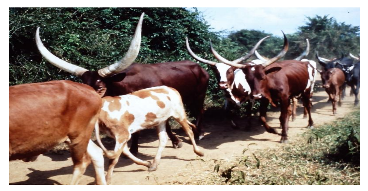
Figure 5. Sanga cattle exemplified by the Watusi breed in Karama Village, Rwanda

Spreading out from their likely origin in the Horn of Africa Sanga breeds now predominate over much of Africa. Many types have long to very long horns. They include the Danakil of the Ethiopian lowlands and the Dinka of the Republic of South Sudan. Farther south are the Bahima of southern Uganda and western Democratic Republic of Congo and the Ankole of Burundi, Rwanda (Figure 5) and western Tanzania. South again another subgroup of Sanga still with long but not so spectacular horns includes the Barotse and Tonga of Zambia and Angola, the Ovambo and Kaokoveld of Namibia, the Tswana of Botswana, the Mashona and Tuli of Zimbabwe, the Nguni of Zimbabwe, Mozambique and Swaziland and the Basuto of Lesotho (Felius, 1985; Mason, 1996).