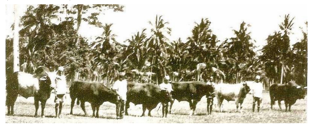
Figure 2. Imported sires (Krishna Valley Indian Zebu, Aberdeen Angus, North Devon, Friesland [sic], Ayrshire and Afrikander) used at the Tanganyika Territory Government Stock Farm at Puku, Dar es Salaam in 1926

In another leap of faith Tarentaise and Pie Noire cattle from the French Alps were taken to the French colonies of Algeria, Morocco and Tunisia early in the twentieth century (Sraïri, 2011). The first exotic dairy cattle in Cameroon were Brown Swiss and were imported by the French colonial administration in the 1930s but they were replaced at the end of the Second World War with Holstein Friesian cattle and Austrian Pinzgauer at one location whereas the Montbéliard was introduced at two other stations for crossbreeding with local cattle (Tambi, 1991). French colonial influence was also evident in Senegal and Mali where the Montbéliard was the animal of choice (Tamboura et al., 1982).