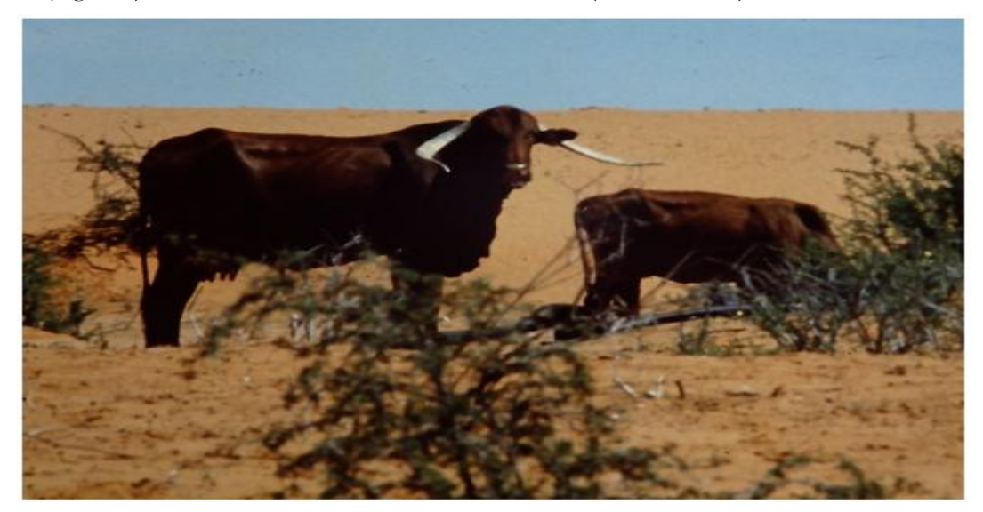
Figure 8. Afrikaner cow (constituting 5/8 of the Bonsmara breed) at Bokspits Ranch in Southwest Botswana (July 1986).

A composite Sanga-taurine, the Bonsmara, became a recognized breed after many criss-cross matings, fixed at 5/8 Afrikaner (Figure 8), 3/16 Hereford and 3/16 Shorthorn blood (Bonsma, 1980).