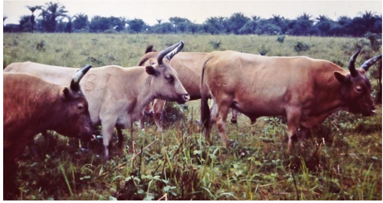
Figure 10. Mixed group of N'dama cattle at Teko Research Station in central Sierra Leone (Photograph: Trevor Wilson, November 1986).

Types of Bos taurus cattle including the N'dama (Figure 10) and the West African Shorthorn group have been indigenous to Central and West Africa for some 7000 years. Over this period they have co-evolved with tsetse flies and trypanosomes (Matthiola and Wilson, 1996) and have developed resistance to trypanosomosis. Constituting less than 6 per cent of the total African bovine population they are nonetheless of supreme importance in that they occupy areas in which non-tolerant stock cannot survive and they contribute substantially to human welfare in at least 18 African countries (Wilson and Hammond, 1994). Trypanotolerant cattle are able to survive in tsetse infested areas without drug treatment but they are generally of small size and have relatively low output. The larger zebu breeds have greater output and with the widespread availability of trypanocidal drugs small holder farmers now often prefer to cross their trypanotolerant breeds with zebu or even replace them altogether. Many taurine types are thus under pressure with reducing numbers of purebred animals. Their unique quality of trypanotolerance – which is free and unlike drugs which have to be paid for and may also have a negative effect on the environment – needs to be preserved for future generations.