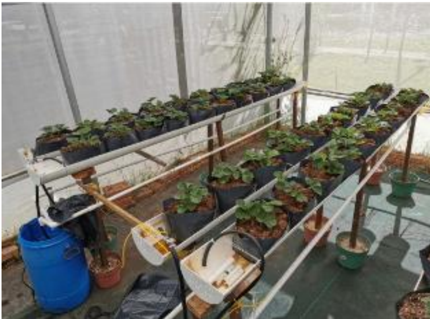
Picture 1. Hydroponic closed gutter system with nutrient solution recirculation, used to evaluate strawberry growth in an agave bagasse-based substrate.